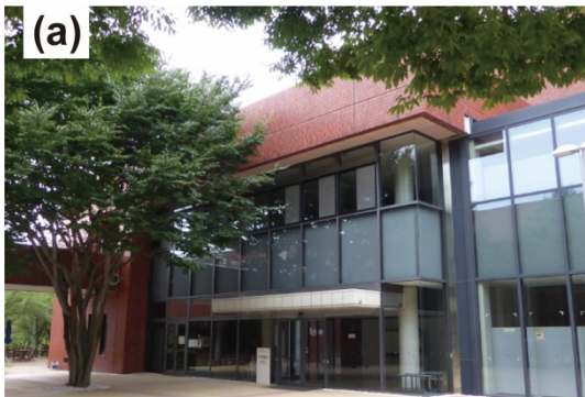
Fig. (a) Venue: AIST Auditorium, (b) Participants and presentations in recent ISS